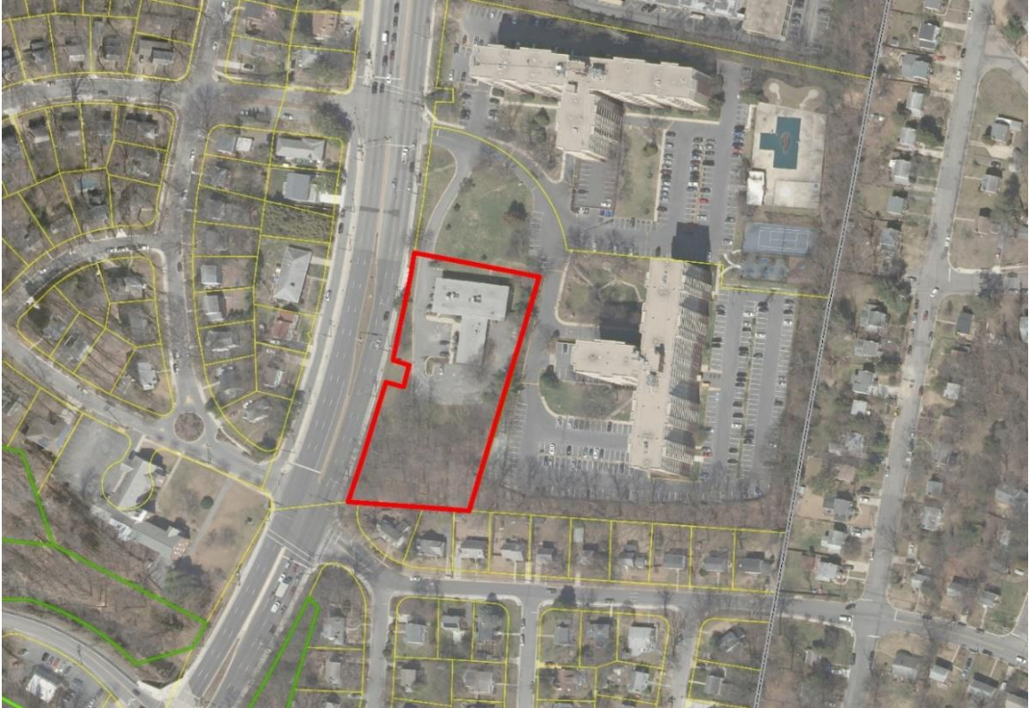
Figure 2 – Takoma Recreation Center, M-NCPPC property to be conveyed to City of Takoma Park