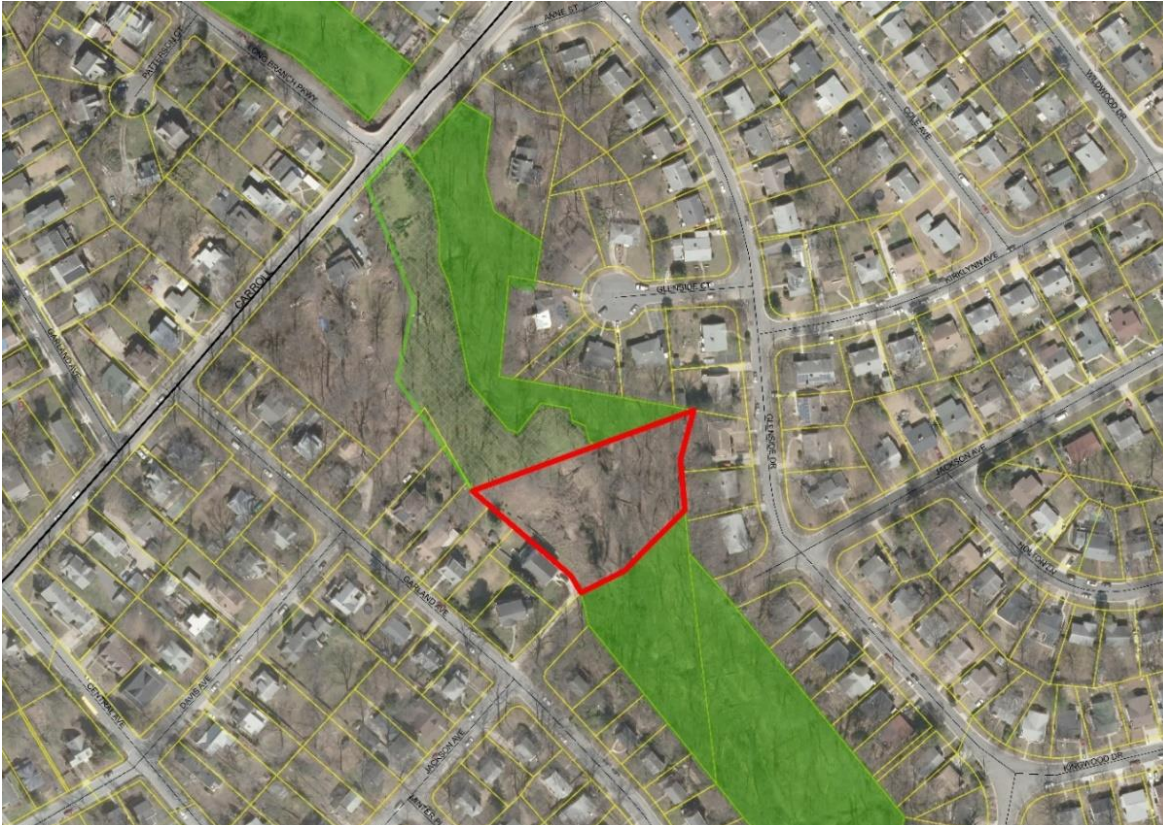
Figure 3 – City of Takoma Park property to be conveyed to M-NCPPC