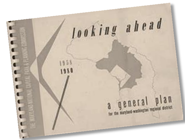
M-NCPPC's 1958 General Plan with midcentury boomerang.