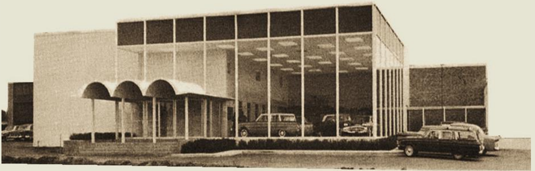
Above: Palmer Ford Showroom, Jamestown Road, John S. Samperton & Associates, 1960. (Demolished 1990)