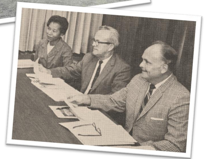
Board Members meeting at the new Hyattsville Library, 1964