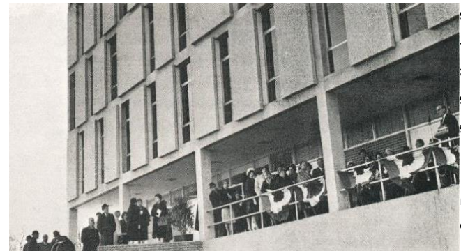
1962 Opening of the Hyattsville Municipal Building (Hyattsville: Our Hometown)

—Henry-Russell Hitchcock quoted in Robert Venturi’s Complexity and Contradiction in Architecture , 1966