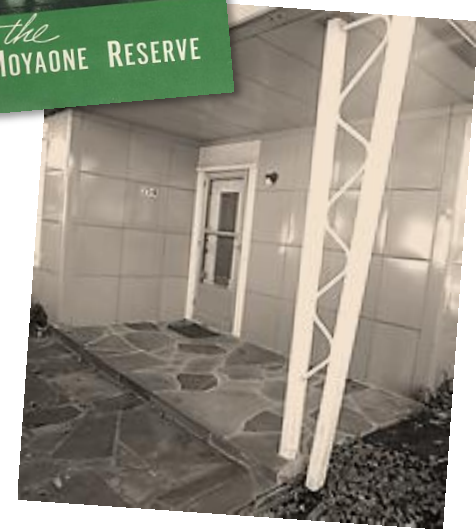
Entrance detail, 1949 Crumly-Murray( Lustron )House, Temple Hills