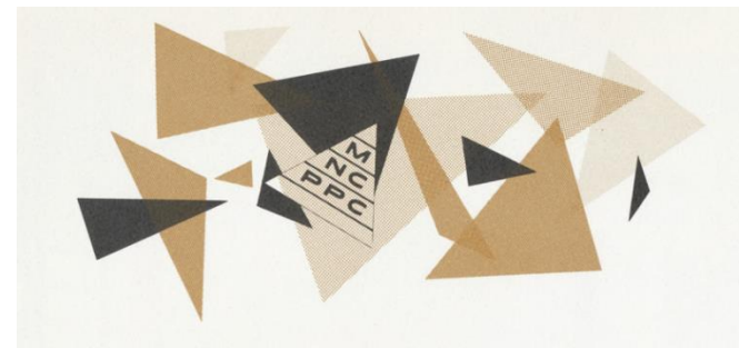
A midcentury collage from M-NCPPC's On Wedges and Corridors

1950s Moyaone Reserve brochure, Accokeek