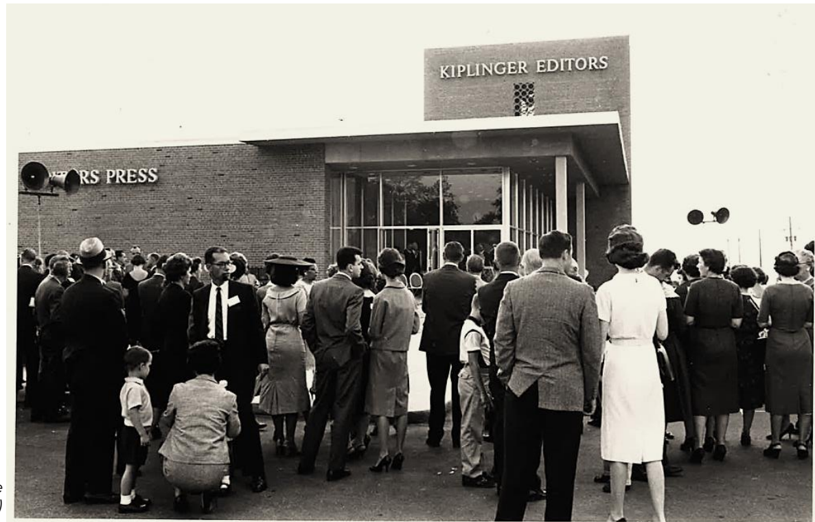
Kiplinger Editors Park opening, 1960.